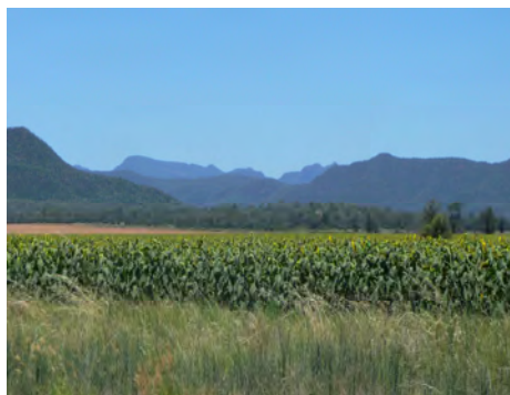
The scenic drive to Sawn Rocks offers stunning views in all directions